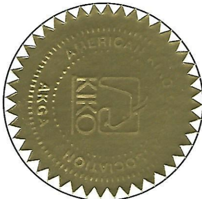
Registered Seal American Kiko Goat Association