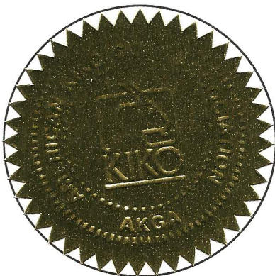
Registered Seal American Kiko Goat Association